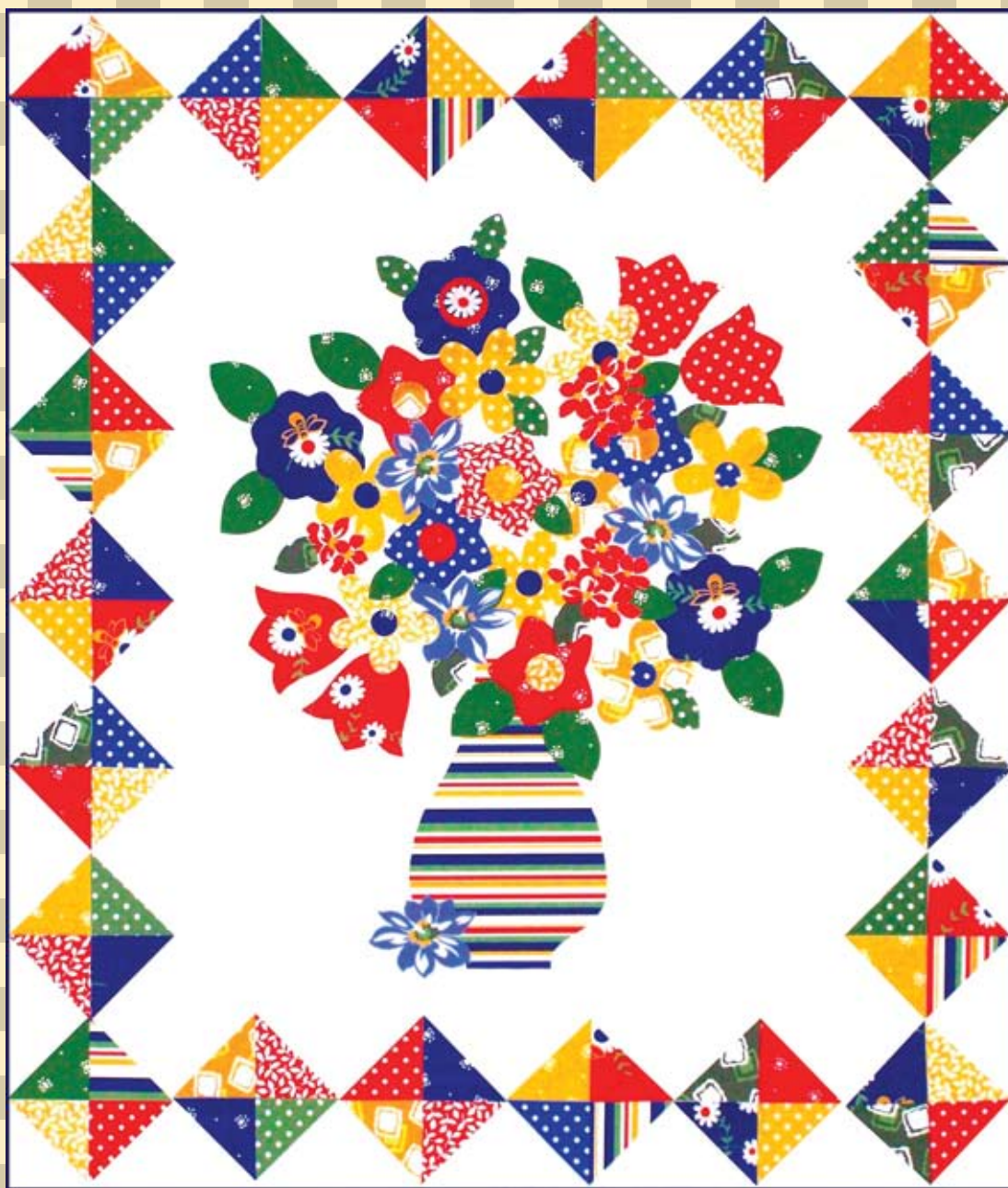
finished size 24" X 28"

Bees Knees Fabric by Glenna Hailey and Maywood Studio